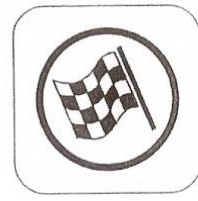
End of regularity test